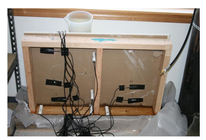
Figure 1. Test setup showing water activity sensors placed at different heights on wallboard suspended in water.

Gypsum wallboard was obtained from a local supply store and used to assemble a 61 x 51 cm wall. The wall frame was composed of fir two-by-four studs and the wallboard was unaltered -5/8 inch gypsum with no covering. The wall was placed in a plastic-lined trough containing 7.6 cm depth of tap-water (Figure 1). After all sensors had reached their peak water activity value, the wall was taken back out of the water and allowed to dry.