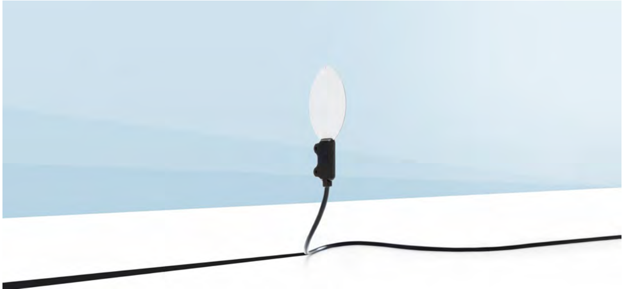
PHYTOS 31 leaf wetness sensor