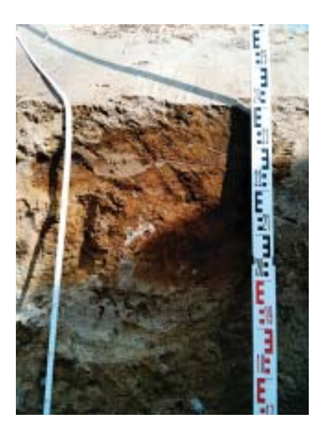
A good lysimeter preserves even small pores and wormholes intact.