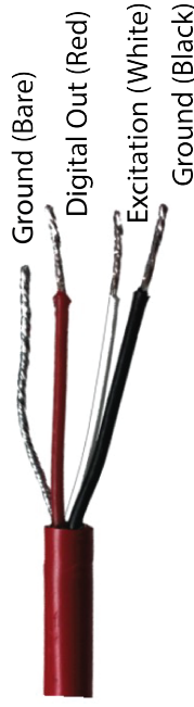
Figure 2: Pigtail End Wiring

Connect the wires to the data logger as Figure 3 shows, with the supply wire (white) connected to the excitation, the digital out wire (red) to a digital input, the bare ground wire to ground.(Figure 2)