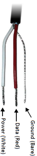
Figure 2: Pigtail End Wiring

Connect the wires to the data logger as Figure 2 shows, with the supply wire (white) connected to the excitation, the analog out wire (red) to an analog input, the bare ground wire to ground as illustrated below.