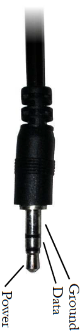
Figure 1: Stereo Connector

The following software support the 10HS sensor: