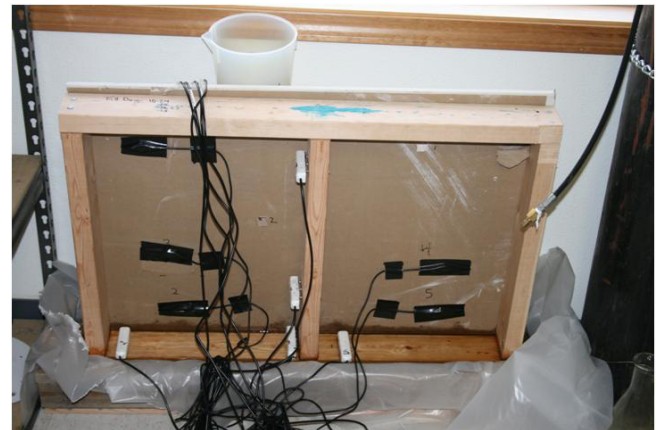
Figure 1. Test setup showing water activity sensors placed at different heights on wallboard suspended in water.

Gypsum wallboard was obtained from a local supply store and used to assemble a 61 x 51 cm wall. The wall frame was composed of fir two-by-four studs and the wallboard was unaltered -5/8 inch gypsum with no covering. The wall was placed in a plastic-lined trough containing 7.6 cm depth of tap-water (Figure 1). After all sensors had reached their peak water activity value, the wall was taken back out of the water and allowed to dry.